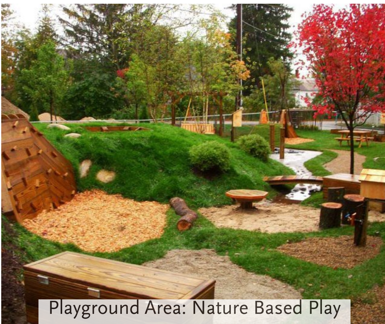
Playground Area: Nature Based Play