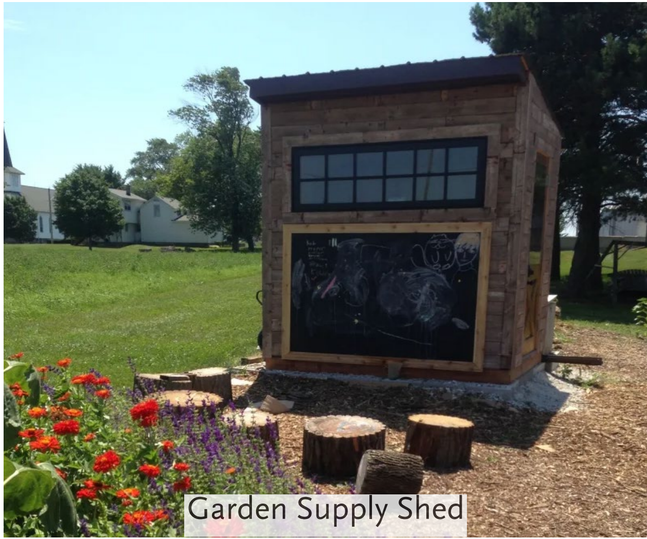
Garden Supply Shed