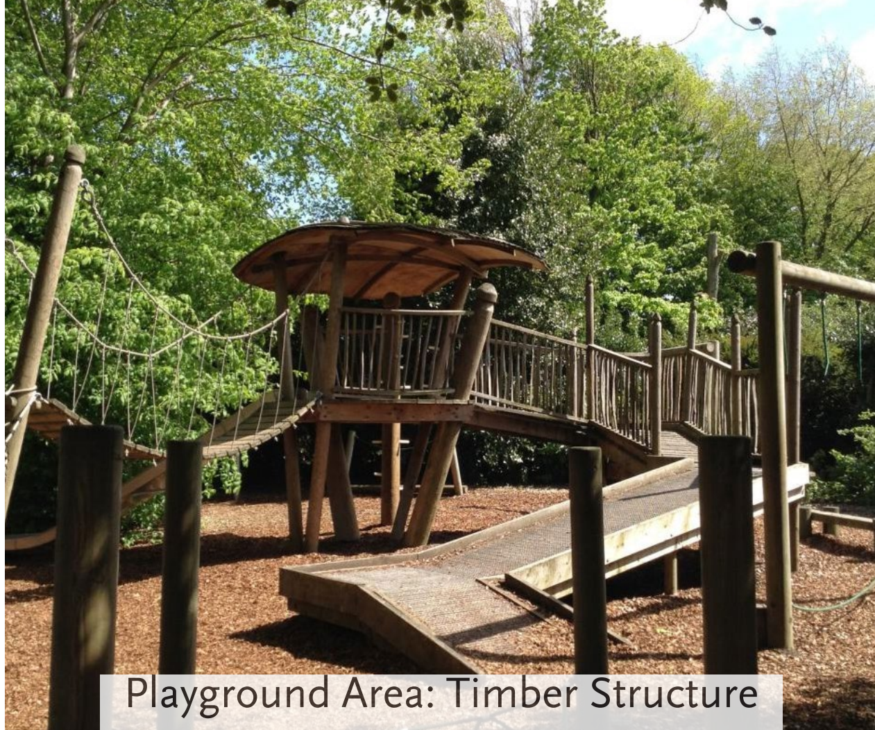
Playground Area: Timber Structure

Place Post-It Notes With Your Comments Here