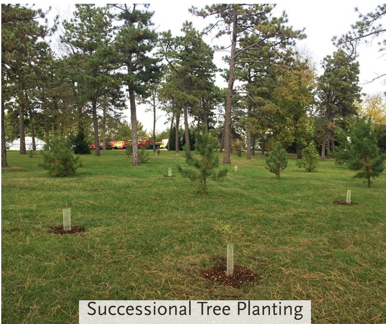
Successional Tree Planting