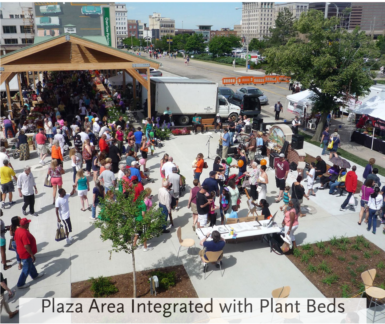
Plaza Area Integrated with Plant Beds

Place Post-It Notes With Your Comments Here