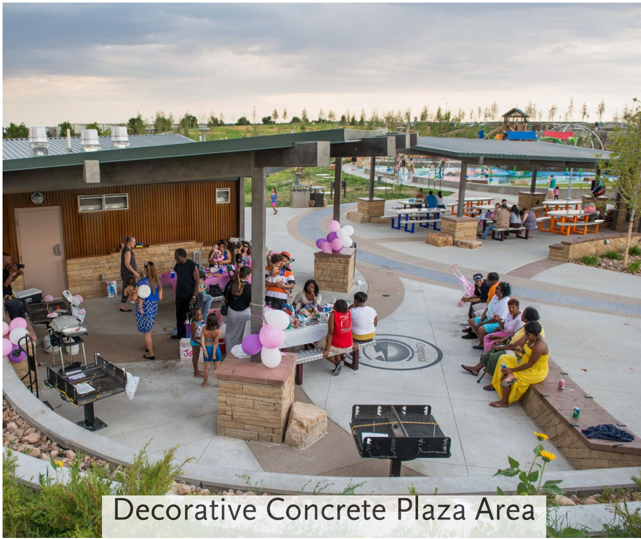
Decorative Concrete Plaza Area