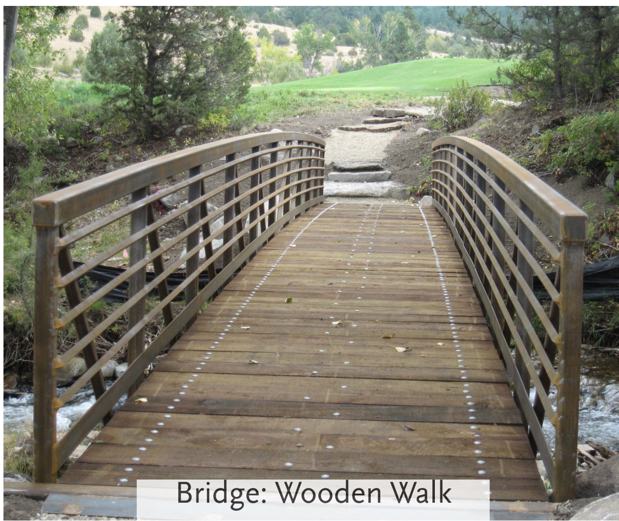
Bridge: Wooden Walk

Place Post-It Notes With Your Comments Here