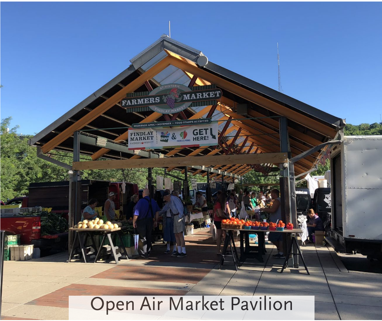
Open Air Market Pavilion