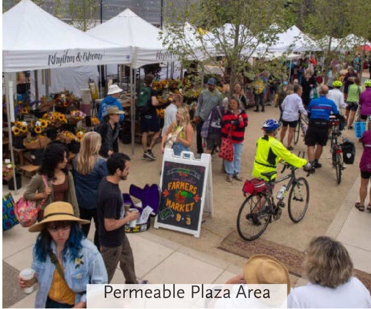
Permeable Plaza Area