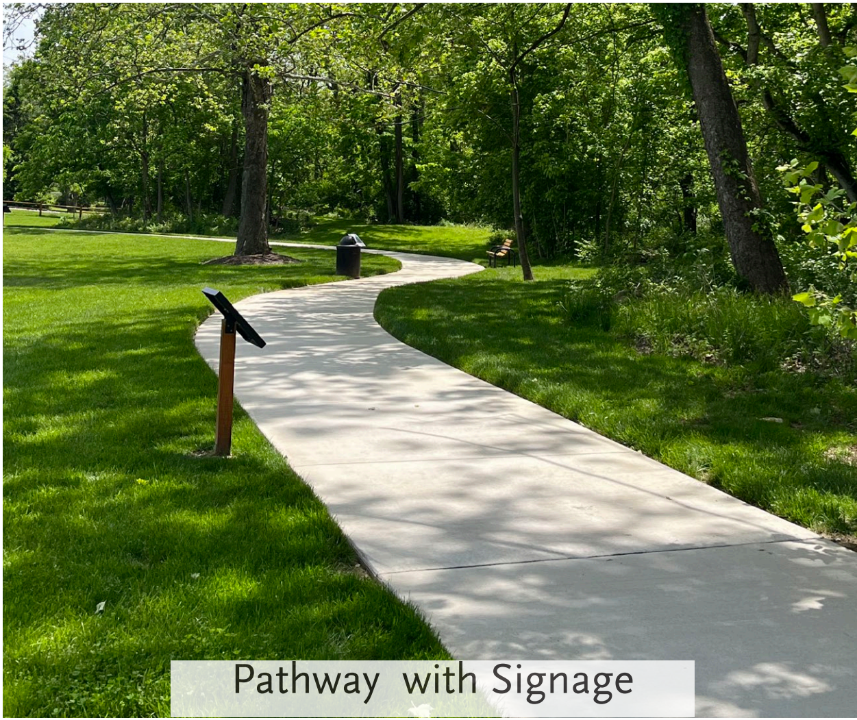
Pathway with Signage