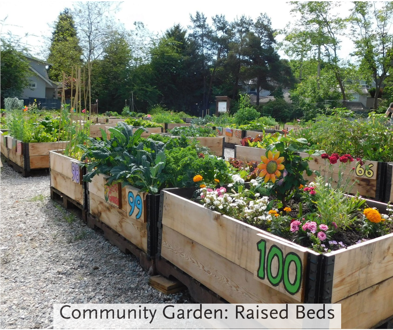
Community Garden: Raised Beds