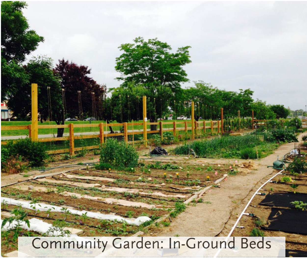
Community Garden: In-Ground Beds